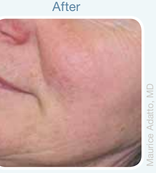
Before After Individual results may vary and are not guaranteed.