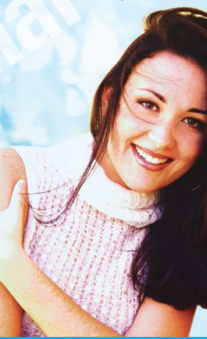
An Effective Alternative to Oral and Topical Medications.